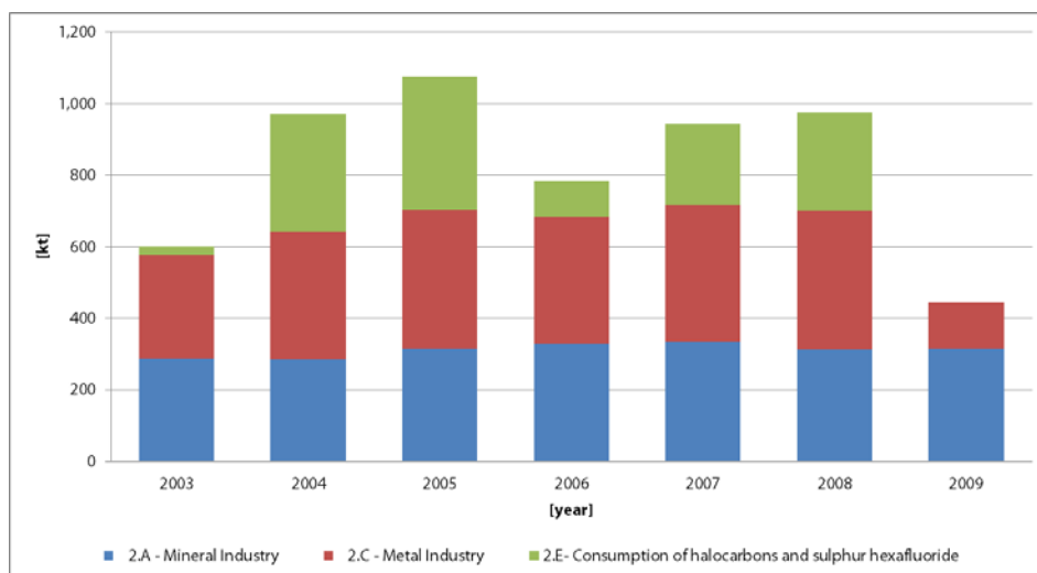
Figure 2: GHG emissions from industrial processes

In the key category analysis, the cement production and ferro-alloy production are identified as key categories. Also the HFCs consumption in refrigeration and air conditioning is identified as a key category in the period of 2004-2008 because of the high global warming potential of HFCs.